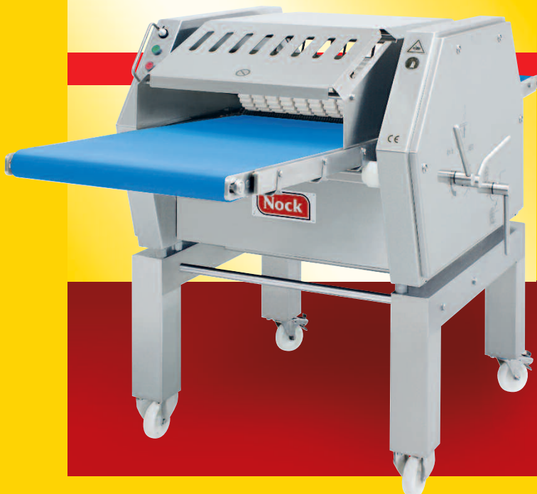
Cortex CB 604 with ASG