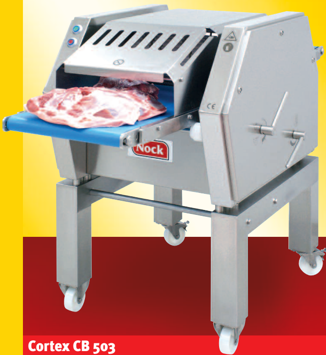
Cortex CB 503

The conveyORIZED NOCK derinding machines for industrial use are equipped with long conveyors and operate with high cutting speeds. They may not be operated in open top (manual) operation.