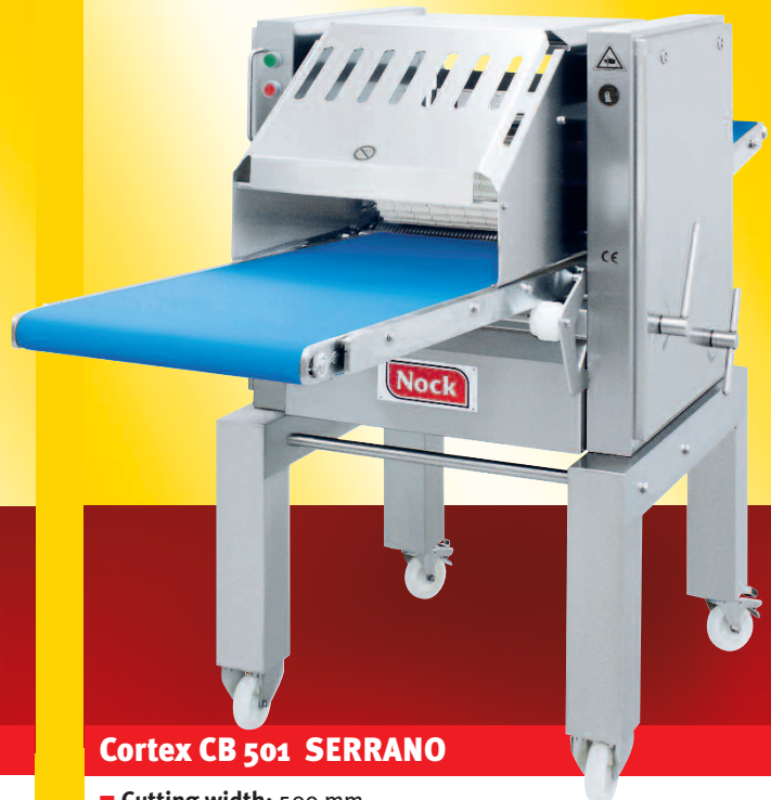
Cortex CB 501 SERRANO